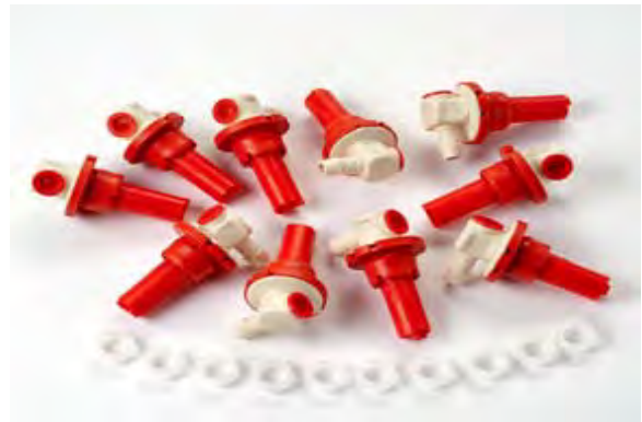
INJ-TL10 Terminating Injector, 10 pack, with collars