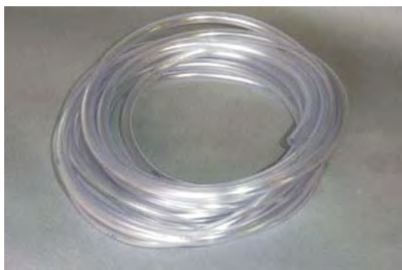
INJ-198 Tubing, 25 feet 1/2" OD