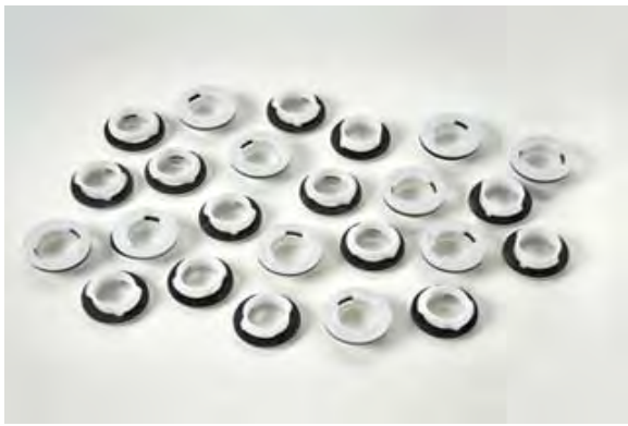
INJ-656 Quarter turn vent adapter (24 pack)