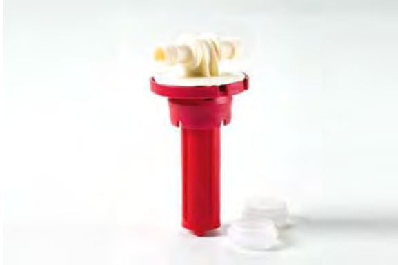
INJ-CL1A ClampLock Water Injector, Extended Downtube, for Standard Bayonet Vent Openings