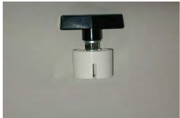
INJ-RWR Quarter Turn Wrench for Raised Adapters