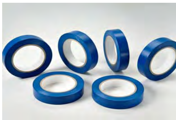
INJ-202 Tape, installation, 36 yd, (6 pack)