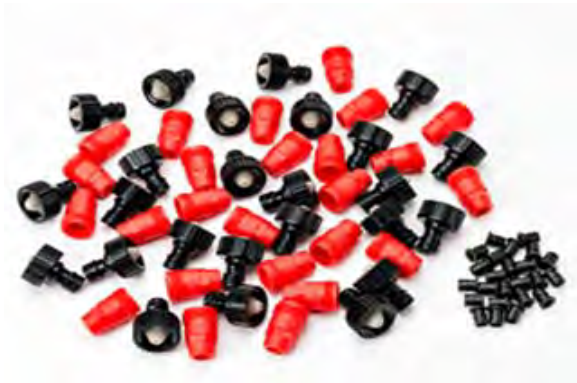
INJ-CP25 Quick-Connect Input Coupling for Water Injectors™ (25 pack)