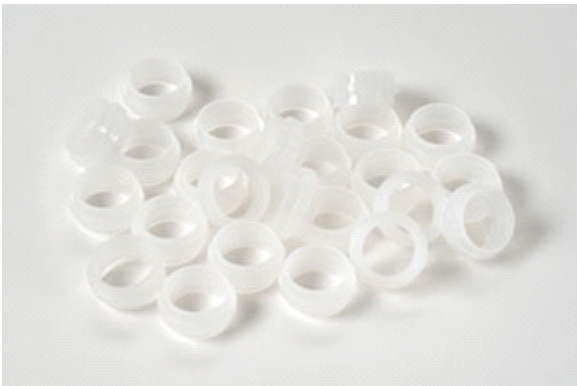
INJ-608 Collars for Water Injectors & Stealth Systems (25 Pack)