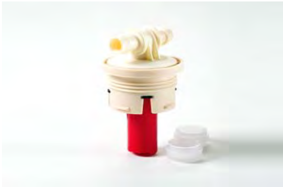
INJ-CL1D ClampLock Water Injector, for DIN Vent Openings